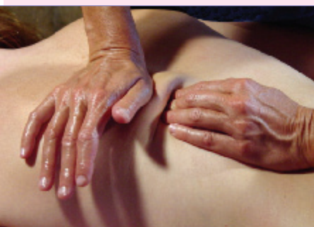
Shortening muscle. When a muscle cannot be shortened anatomically, it can be structurally pushed toward itself, creating a "snow drift" of soft muscle for easy and painless penetration.

4 Shortening muscle. A muscle is much easier to enter when it is in its shortened, rather than lengthened, position. The shortening can be accomplished anatomically, by bending body parts toward each other, thus placing the muscle into a relaxed versus tightened position; or structurally, by using one hand to push the muscle toward the other hand, creating a snowdrift of soft muscle, thus allowing more space for the thumb to penetrate without struggle or pain.