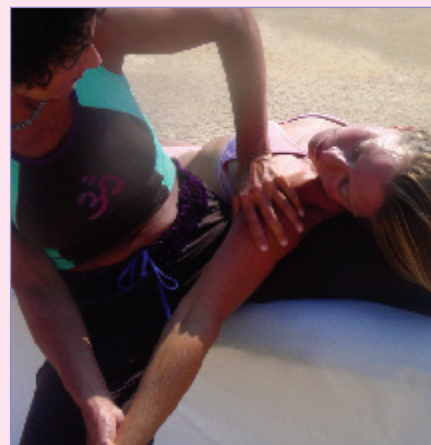
Draping body parts over the therapist's leg frees the client, allowing the body to naturally fall with its own gravitational pull, and creates space for working beneath the body.

2 Body draping. Phenomenal Touch Massage often places the client's body in positions where it can drape itself over the therapist's body or off the table, as a leopard does over a limb. This not only frees the client by lifting her body off the table, allowing it to fall naturally and gracefully with gravity, but it also creates a space for the therapist to reach with ease underneath the limb in order to work three-dimensionally.